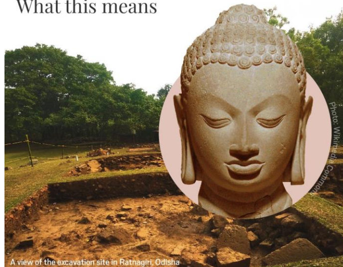
A view of the excavation site in Ratnagiri, Odisha